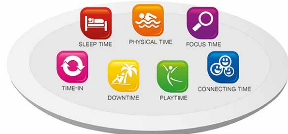
The Healthy Mind Platter for Optimal Brain Matter